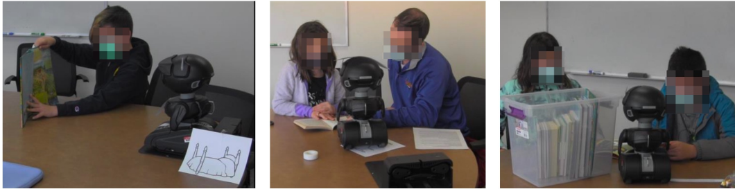
Figure 1: Children reading to the robot for a bedtime care routine: In this study we explored children’s preferences for taking care of a social robot and conducted a feasibility study to evaluate children’s experience of taking care of a robot. Our findings provide insight into designing social robot caretaking activities for children.

RQ1. What types of in-home robot caretaking tasks will be performed regularly by children?